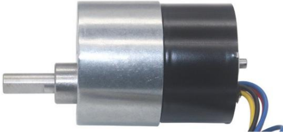
Model : 37SG-3625BL