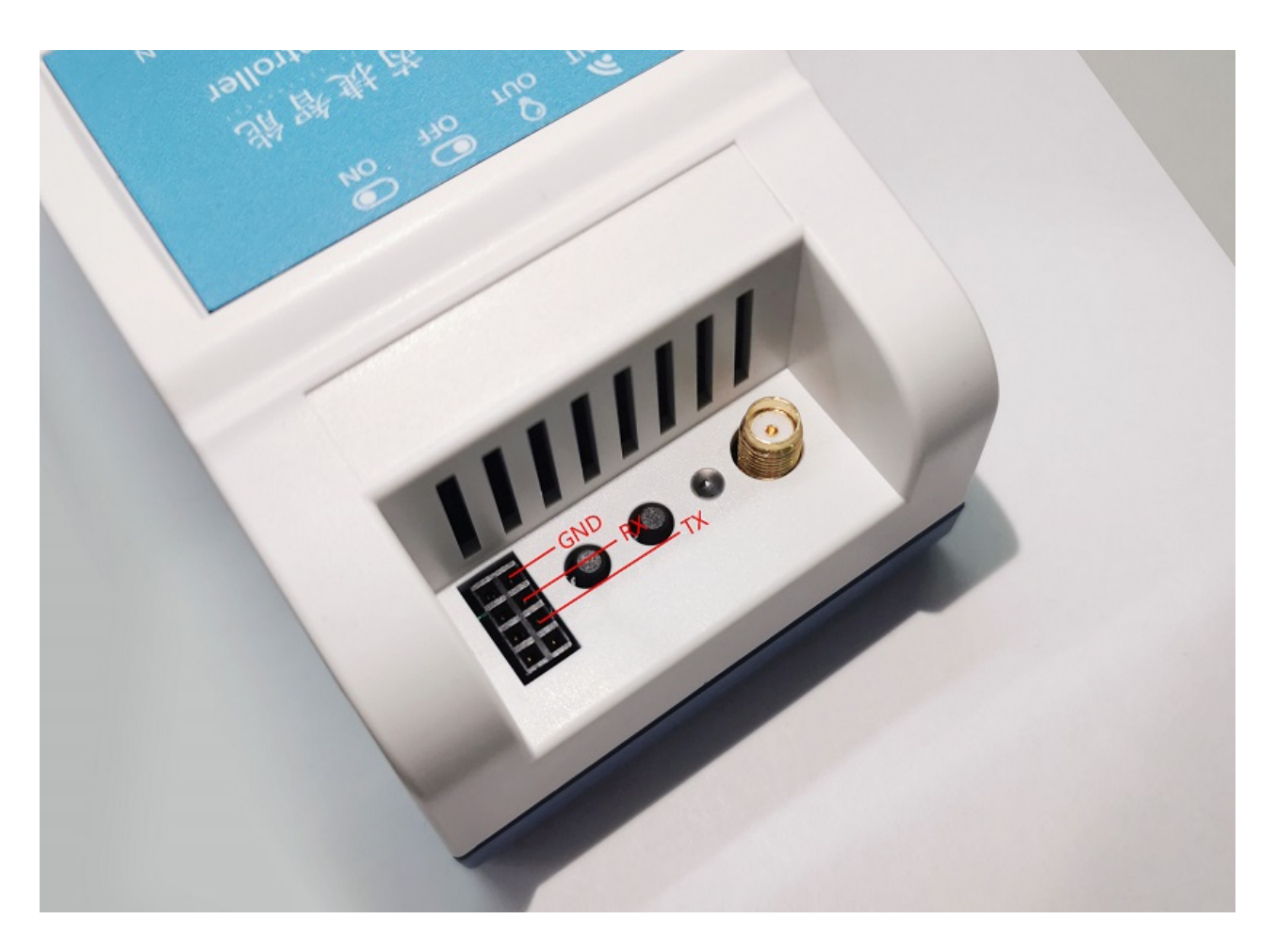
Pic 1-2 Installation