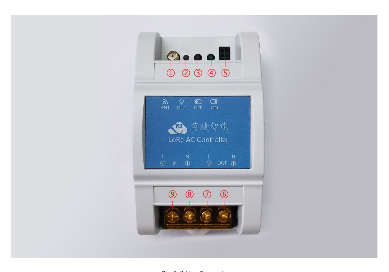
Pic 1-3 Use Example