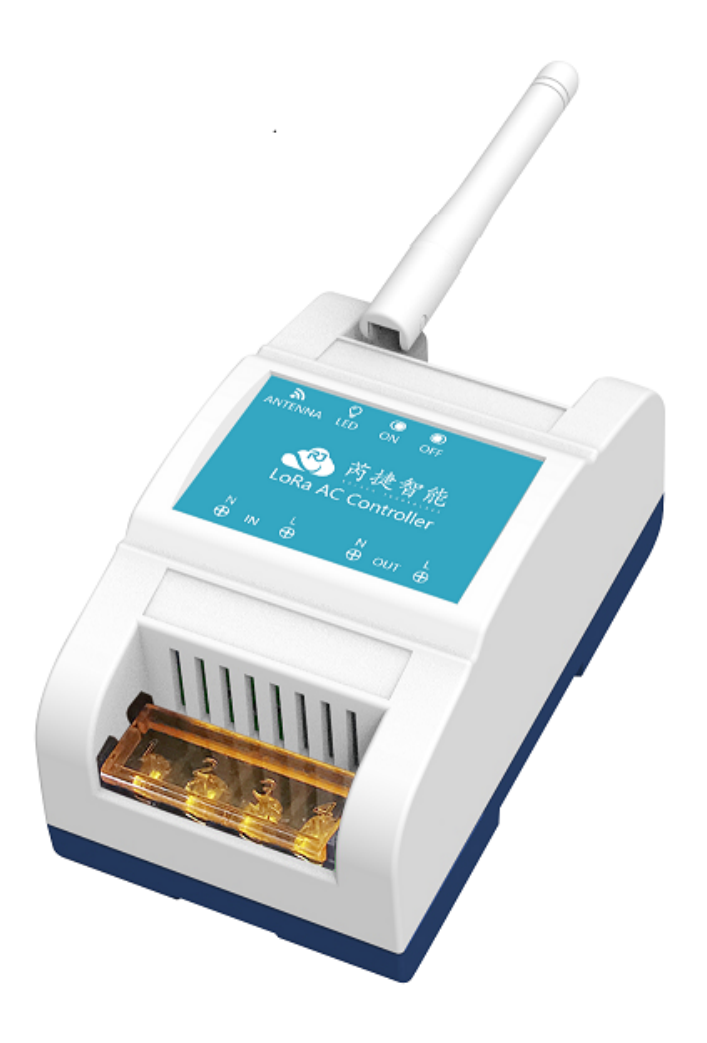
Pic 1-1 Front