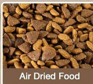
Air Dried Food