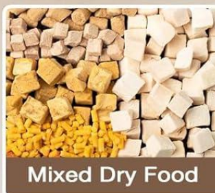
Mixed Dry Food