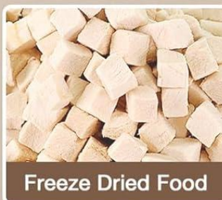
Freeze Dried Food