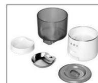
Transparent&Detachable Container Design

Easy to observe food shortage. Detachable food bucket. Easy to clean and install