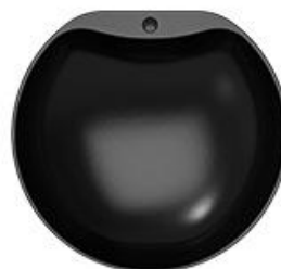
Plastic Feeding Tray