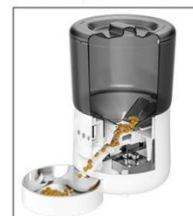
Hard Push Setting

Easy to observe food shortage. Detachable food bucket. Easy to clean and install