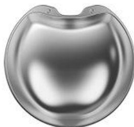
Stainless Steel Bowl