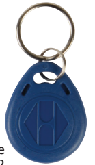
optional access badge part # HAA2866/TAG2