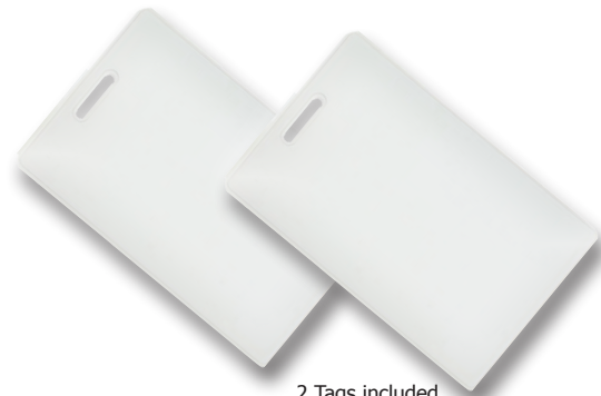
2 Tags included part # HAA2866/TAG