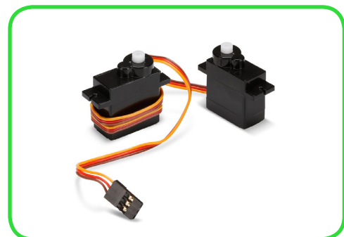
9G SERVO MOTORS (VR006)