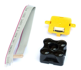
TeraRanger Evo + I2C/UART backboard: