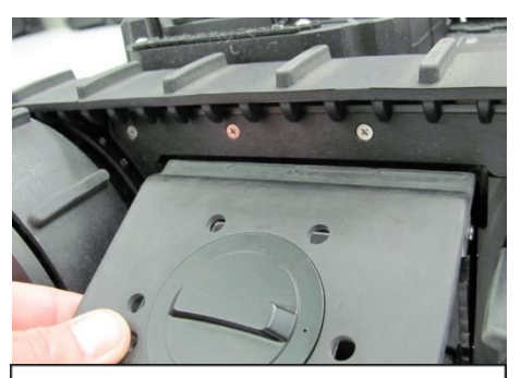
When closing the battery door, make sure the lip at the top strip of the battery door tucks underneath the top of the battery bay.