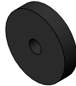
② Isometric view Scale 4:1