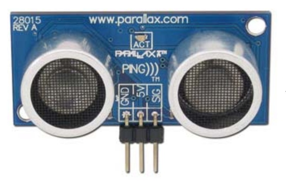
Figure 1 The Ping))) Sensor

The Ping))) sensor is a device you can use with the BASIC Stamp to measure how far away an object is. With a range of 3 centimeters to 3.3 meters, it's a shoe-in for any number of robotics and automation projects. It's also remarkably accurate, easily detecting an object's distance down to the half centimeter.