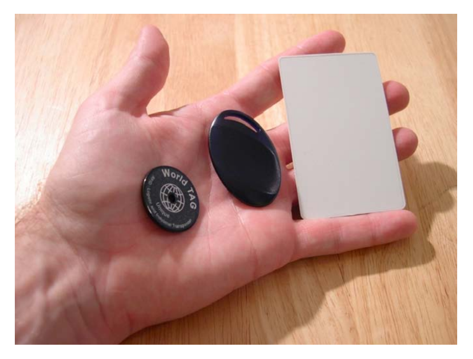
Figure 120.1: Various Sokymat RFID Tags sold by Parallax

Parallax worked with world-famous hardware hacker and engineer-extraordinaire, Joe Grand (owner of Grand Idea Studio), to create a low-cost RFID reader that would be simple to use in hobbyist and professional projects. The result is a fully integrated reader PCB that contains the required circuitry and matched antenna to work with passive, read-only RFID tags. Note that the reader is specifically designed for tags that contain low-frequency (125 kHz) RFID components from EM Microelectronic. Parallax carries a couple tag types (disc and ISO card) that are manufactured by Sokymat and that meet the requirements of the reader. Figure 120.1 shows a few sample tags from Sokymat that I played with; you can clearly see the disc (far left) and ISO card (far right) tags.