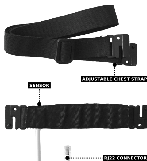
Fig. 1. The sensor is provided with a convenient elastic chest strap to secure it in place.

Our piezoelectric respiration sensor is an affordable option for respiratory analysis in a wide range of applications. It has a localized sensing element that measures displacement variations induced by inhaling or exhaling. The elastic strap is provided with the sensor to secure it in place, and can be adjusted in length, enabling the sensor to be applied in different anatomies (e.g. male and/or female) and body locations (e.g. thorax and/or abdomen). Typical applications include monitoring of respiratory rate, respiratory cycle regularity, relative amplitude of the cycle, and others. When multiple sensors are used simultaneously it enables diaphragmatic versus thoracic breathing assessment (e.g. for biofeedback).