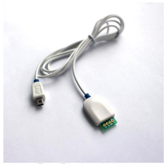
Fig. 1. I/O breakout cable image

BEWARE when using this accessory as to preserve electrical isolation of the user. We expressly disclaim any liability whatsoever for any direct, indirect, consequential, incidental or special damages, including, without limitation, lost revenues, lost profits, losses resulting from business interruption or loss of data, regardless of the form of action or legal theory under which the liability may be asserted, even if advised of the possibility of such damages.