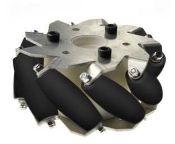
Nexus Robot Mecanum wheel

Using four of mecanum wheels provides omni-directional movement for a vehicle without needing a conventional steering system slipping is a common problem in the mecanum wheel as it has only one roller with a single point of ground contact at any one time.