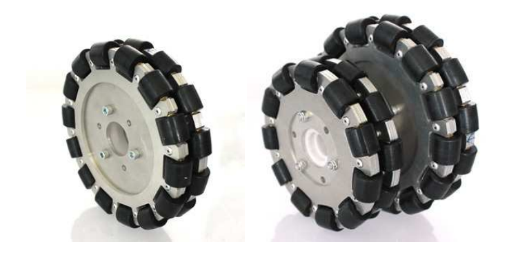
Nexus Robot robot kit using omni-wheels