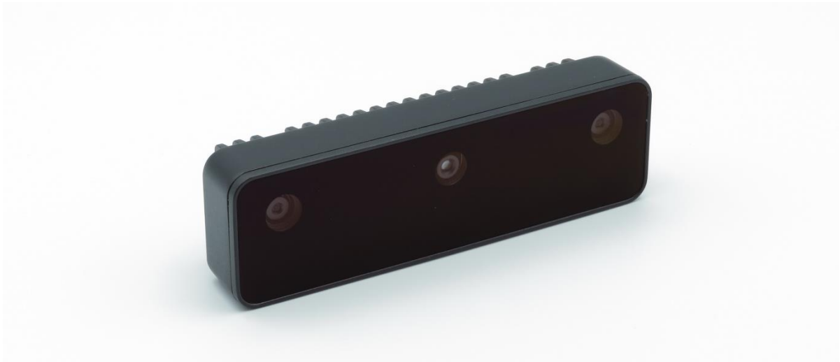
Figure 1 – OAK-D S2