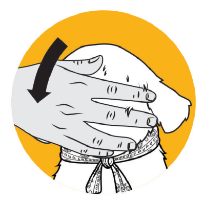
Pet the back of the pup's head and it will move.