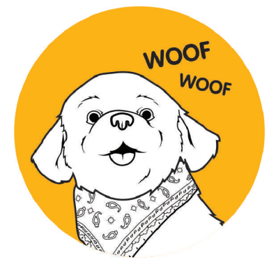
Talk to your pup to see it look toward you and hear it respond with puppy-like noises and BarkBack<sup>™</sup> technology.