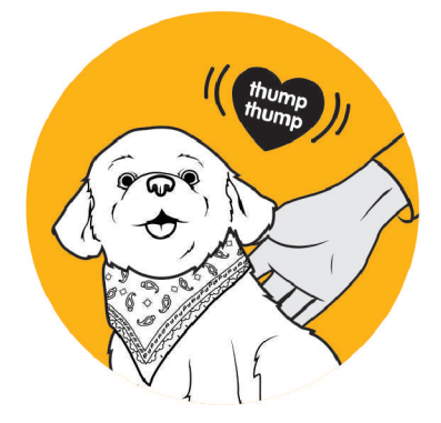
Slowly and gently pet your pup's back to experience a heartbeat sensation.