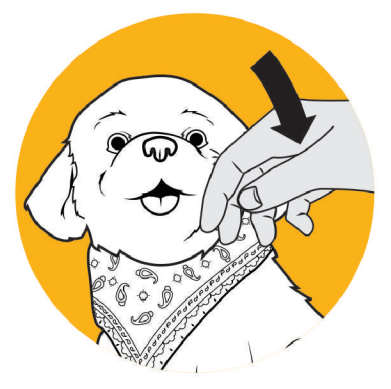
Pet the pup's left or right cheek and it will nuzzle your hand.

Your pup will respond differently depending on where you touch it.