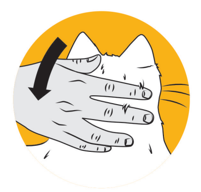
Pet the back of the cat's head and/or its back and your cat will purr happily.