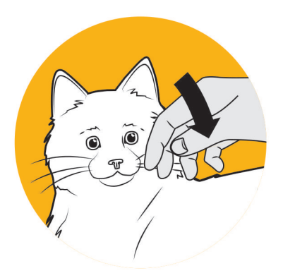
Pet the cat's left cheek and it will move its head toward your hand.

Your cat will respond differently depending on where you touch it.