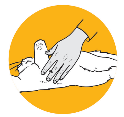
If you keep petting your cat, it will roll on its back so you can pet its belly.