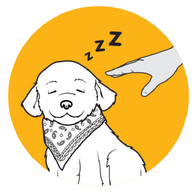
If you don't interact with your pup for a few minutes, it will go to sleep. To wake it up, simply walk by or give it a gentle pat on the head.