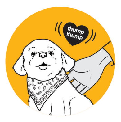
Slowly and gently pet your pup's back to experience a heartbeat sensation.