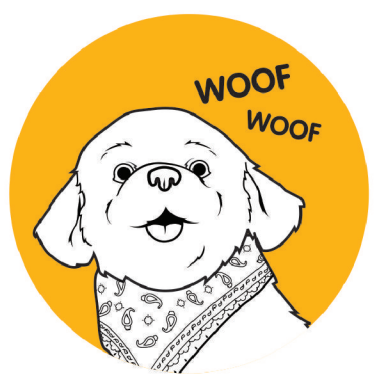
Talk to your pup to see it look toward you and hear it respond with puppy-like noises and BarkBack™ technology.