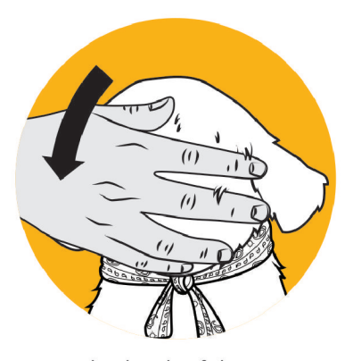
Pet the back of the pup's head and it will move.