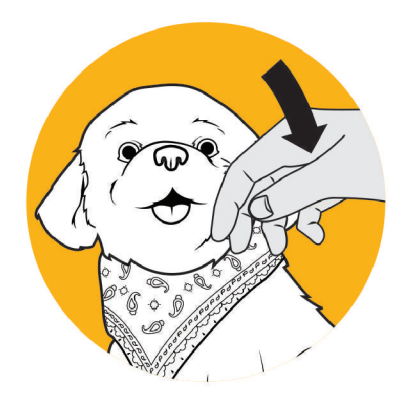
Pet the pup's left or right cheek and it will nuzzle your hand.

Your pup will respond differently depending on where you touch it.