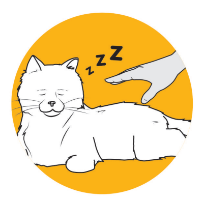
If you don't touch your cat for few minutes, it will go to sleep. To wake it up simply give it a gentle pat on the back.