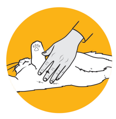
If you keep petting your cat, it will roll on its back so you can pet its belly.