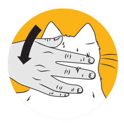
Pet the back of the cat's head and/or its back and your cat will purr happily.