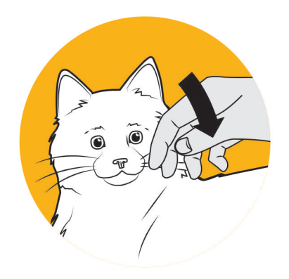
Pet the cat's left cheek and it will move its head toward your hand.

Your cat will respond differently depending on where you touch it.