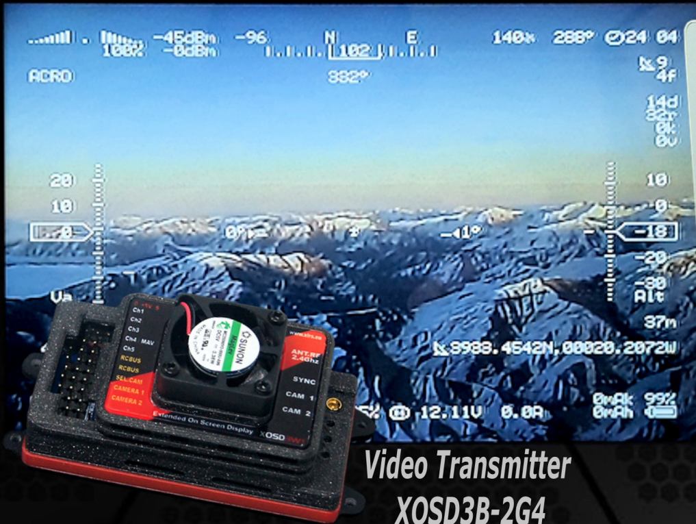
Video Transmitter XOSD3B-2G4