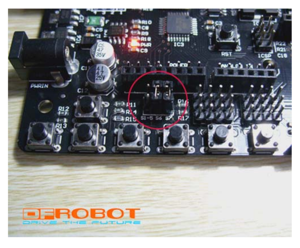
Figure 3 Button Enable Jumpers

To enable S6 and S7, please apply the jumpers indicated in the red circle. S6 uses Digital Pin2, S7 uses Digital Pin3. Once these enable jumpers have been applied, Pin 2 and 3 will be occupied (Figure 3).