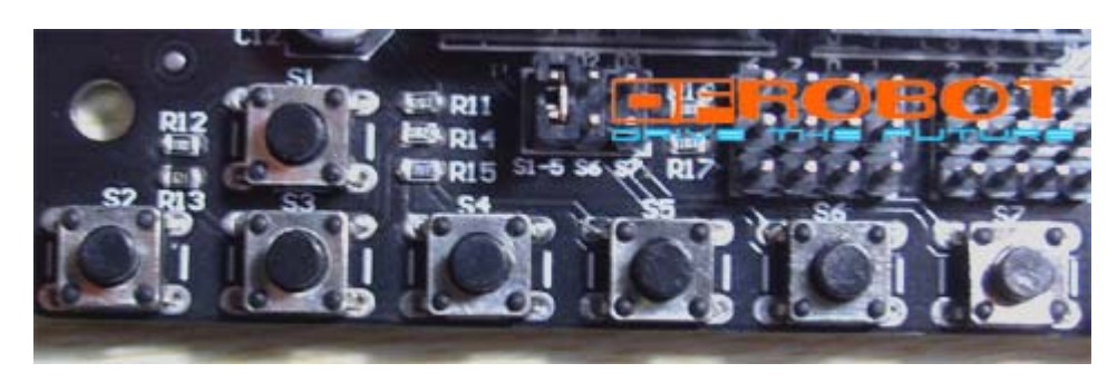
Figure 2 Romeo Buttons

RoMeo has 7 build in buttons S1-S7 (Figure 2). S1-S5 use analog input, S6,S7 use digital input.