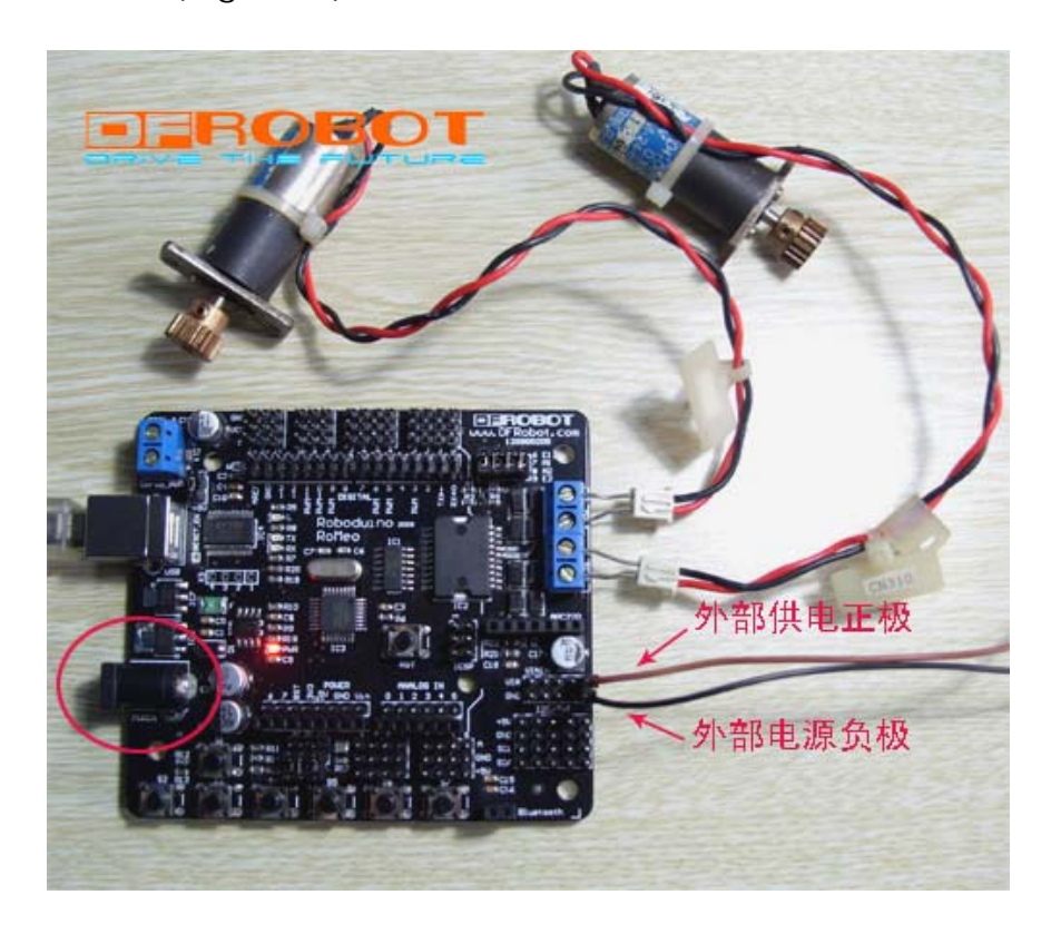
Figure 4 Romeo Motor Connection Diagram

Connect four motor wires to Motor Terminal. And apply power through motor power terminal (Figure 4).