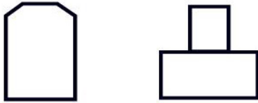
Incorrect Mold Geometry