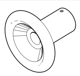
FIGURE 1— The DRO spindle handwheel with the longer shaft.